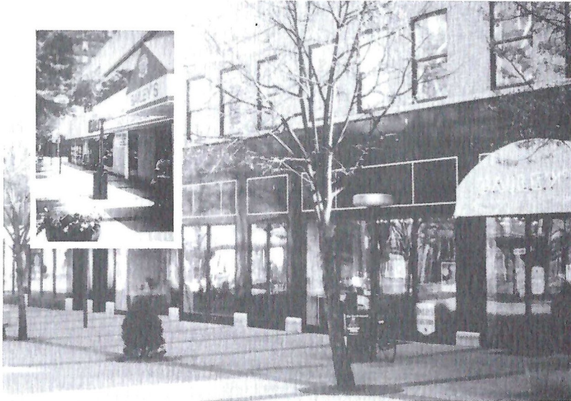
Caldwell Trust Building renovation, Huntington, WV

MAIN STREET WEST VIRGINIA is a self-help program offering strategic planning, technical assistance, and leadership to communities actively participating in the Main Street West Virginia program. Design assistance is one of the services provided in an effort to help preserve the architectural integrity of these communities. The uniqueness of your community is an asset. Encouraging business and property owners as well as community leaders to build on that asset can be an exciting and challenging community effort—one that pays big dividends in community pride and a marketable downtown business district.